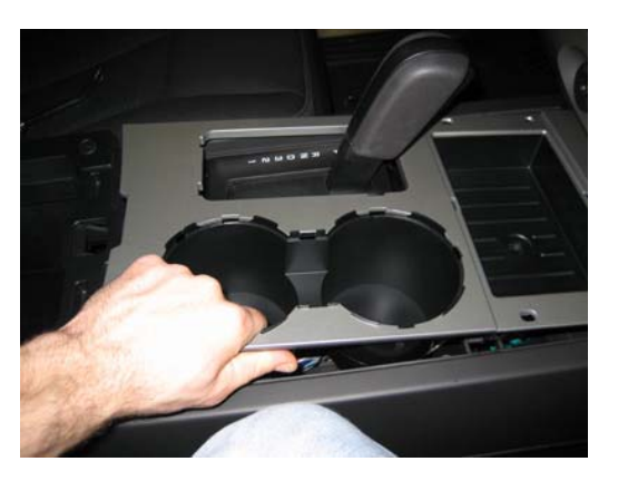
Remove trim panel from console.